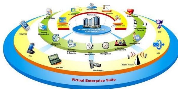
Figure: Virtual Model of PLM implemented Public Administration Organization.

such as fulfilling dynamic and individual needs, utilization of technological development, and collaboration in innovation, continuous process development and not forgetting efficiency requirements of internal processes of the organization and transparency in the process. The practical objective of this research work is to plan a model of PLM acquisition and implementation for public administration to develop effective project management system through which they can manage their entire process effectively, maintain smooth coordination and integration throughout the organization, and different internal department and external agency to enhance project management, process management, working style, effective documentation, security and transparency throughout organization.